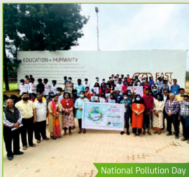
National Pollution Day