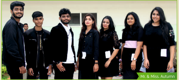
Mr. & Miss. Autumn

Judging was not limited to garments, but was focused on walking stance, attitude, hair, accessories, communication ability and cognitive skills. The entrants earned chattering amongst the spectators.