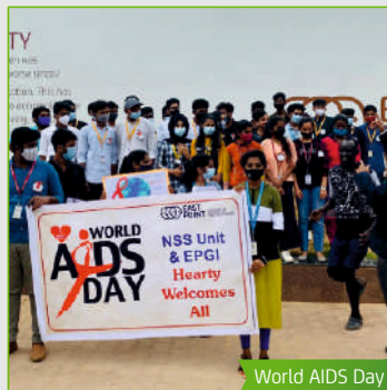
World AIDS Day

Event conducted on the occasion of World AIDS Prevents Day on 1st December, 2021 in coordination with EPGites and staff of NSS Unit.